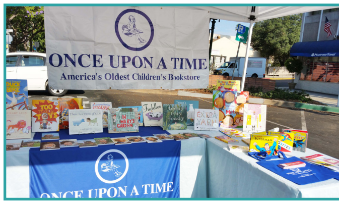
Our booth at the Montrose Farmer's Market