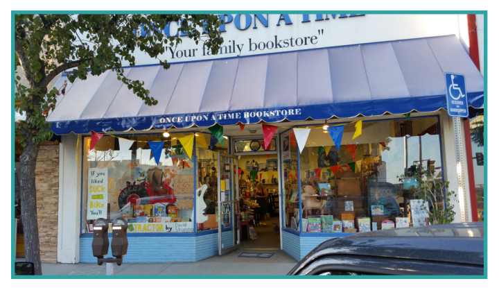
Our storefront in Montrose Shopping Park

Not seeing what you are looking for? We would love to work with you and your ideas!